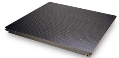
H305 and H520 remote bases.