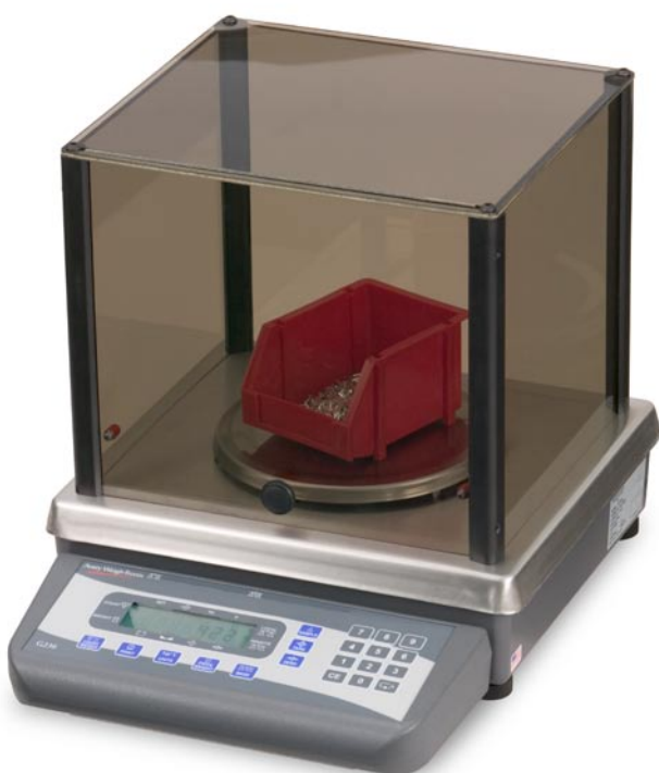
G236 with draft shield.

The G236 is easy-to-operate, no-nonsense digital counting scales that weigh extremely light parts and reduce the time required to count, with accuracy of up to 99%. Ask your distributor for more information about these high-precision scales.