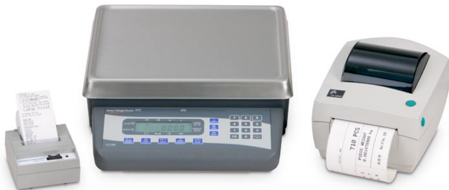
G236 with optional printers.